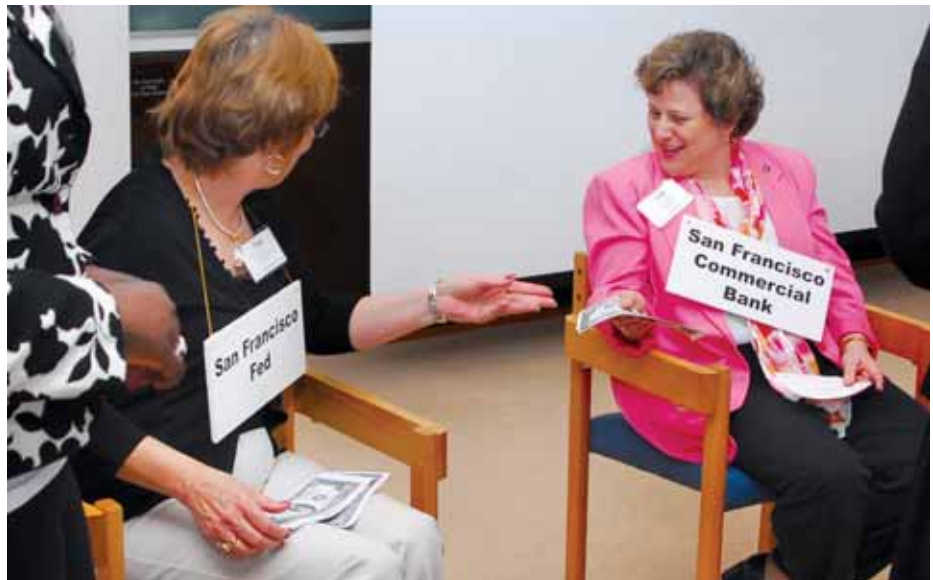
Public Affairs piloted two sessions of the “Back to School at the Fed” program, designed to give bankers the tools to conduct successful classroom visits on the Federal Reserve System, financial literacy, and basic economic principles.