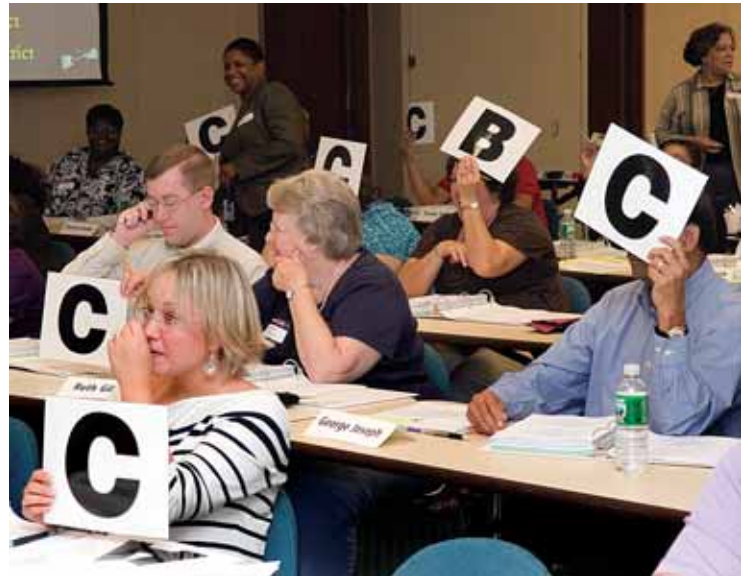
Fed training gives bankers guidance on reporting information that helps maintain stability in the financial system.

to the stability of the nation’s financial system. Along with the Virginia Bankers Association, Public Affairs conducted “Back to School with the Fed.” The program prepared bankers to educate students in their communities about the Fed and the economy.