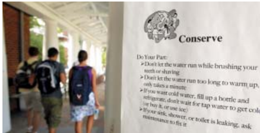
Water conservation signs were prominent all over the University of Virginia campus as students and faculty worked together in an effort to conserve water at the University and the surrounding Charlottesville, Va., area during the 2002 drought.

"When there are no droughts, there are no choices — people don't think about it," Shabman notes. But the legacy of recent droughts coupled with exploding populations in the District's urban areas has put water allocation, along with pricing and conservation measures, in the spotlight.