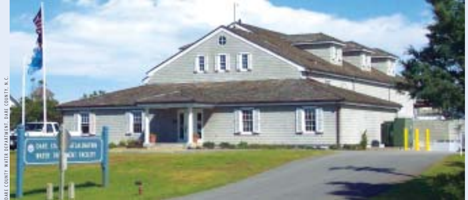
Parts of coastal North Carolina depend on desalted groundwater to supplement their water supply. Dare County, N.C., has built three desalination plants over the last 14 years to support their burgeoning residential development and tourist trade.

Still, water utilities can't afford to produce potable water from the blue seas surrounding coastal communities. Seawater, as well as groundwater near the surface, is very salty, requiring more energy for the desalination process. In addition, the water must be pre-filtered.