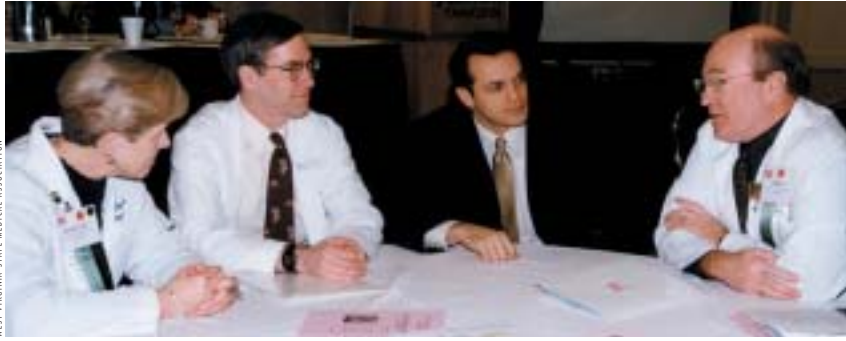
WEST VIRGINIA STATE MEDICAL ASSOCIATION