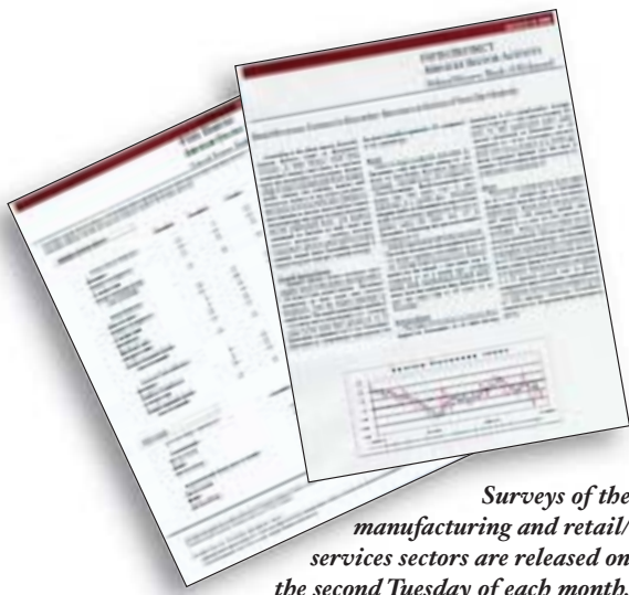
Surveys of the manufacturing and retail/services sectors are released on the second Tuesday of each month.

economic growth and then attached a numerical score to the description. “We shuffled the Beige Books so we didn’t know what time period they were referring to. We tried to guard against using our knowledge of what actually happened.”