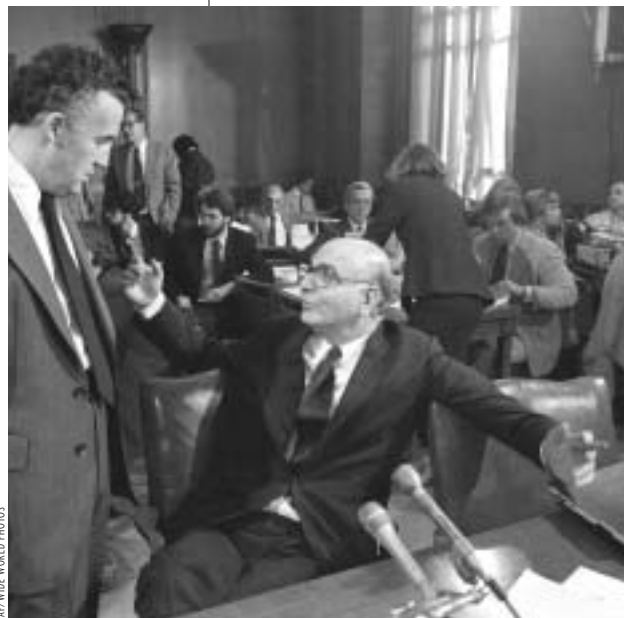
Former Federal Reserve Chairman Paul Volcker talks with Sen. Paul Sarbanes of Maryland prior to a 1979 Senate hearing on monetary policy. The Federal Reserve is formally independent of the executive and legislative branches, but the President appoints the Fed's chairman, who must report regularly to Congress.

Inflation can also act as a source of revenue for governments, further tempting them. Even if a government promises not to inflate, the public may remain skeptical, producing high inflationary expectations. By delegating responsibility for money creation to a central bank, the legislature can remove the temptation to abuse its power and pursue bad monetary policy for short-run gain. (It is important to note that this temptation to