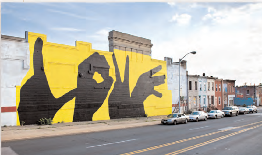
Kickstarter funded the Baltimore Love Project’s mural on Broadway East and North Avenue in East Baltimore. The online campaign had 101 backers, more than half of whom pledged $35 or more.