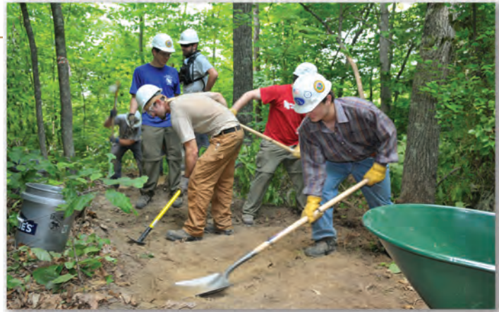
Boy Scouts build a trail at the New River Gorge National River.

The Summit's operation also will create 207 full-time equivalent jobs, mostly seasonal camp workers, according to an economic impact study commissioned by the BSA and conducted by Syneva Economics, a consulting firm based in Asheville, N.C. That projection increases to 486 full-time equivalent jobs in later years as the complex becomes substantially complete. Those numbers do not include the impact of the National Jamboree, which is expected to generate more than $41 million in local expenditures every four years.